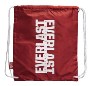
REF: EV2SKB27 COLOR: Rojo