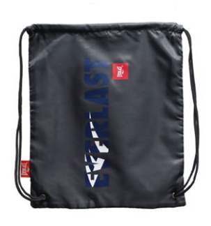
REF: EV2SKB12 COLOR: Gris