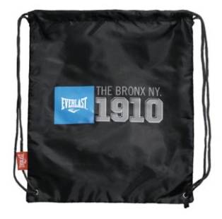
REF: EV2SKB31 COLOR: Negro