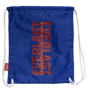
REF: EV2SKB23 COLOR: Azul