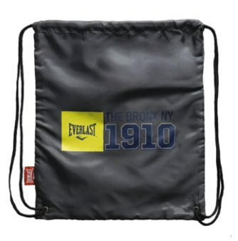
REF: EV2SKB32 COLOR: Gris