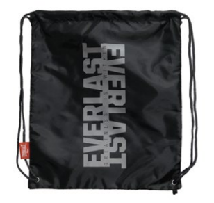
REF: EV2SKB21 COLOR: Negro