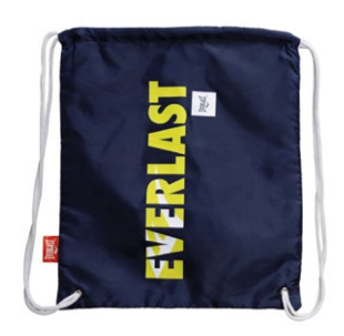
REF: EV2SKB13 COLOR: Navy