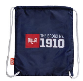
REF: EV2SKB33 COLOR: Navy