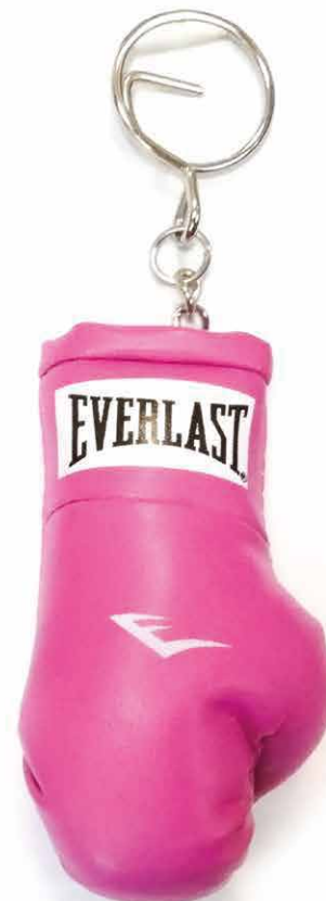
SKU :700000 -PK COLOR: Pink