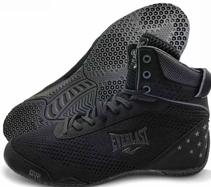
SKU: ELWA69D BLACK / GREY