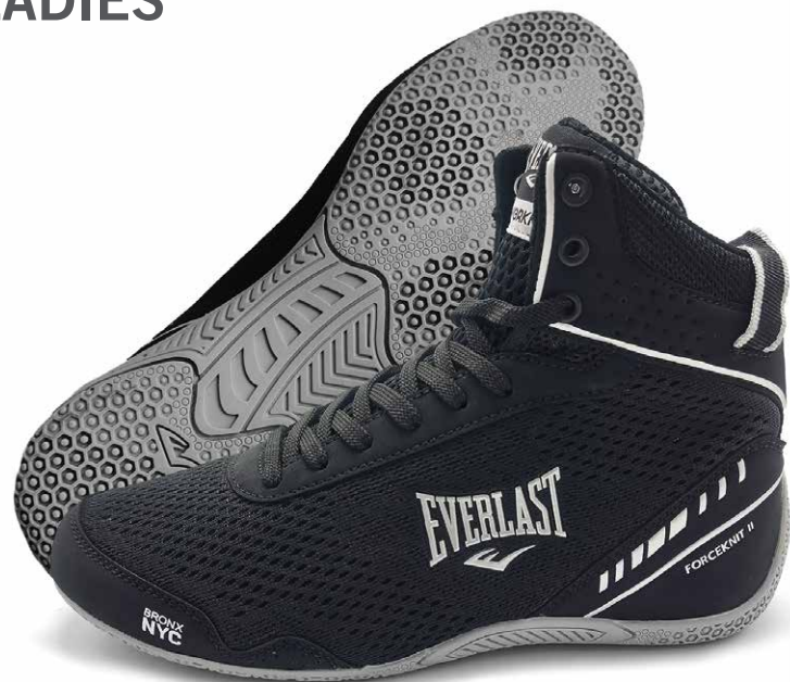
SKU: ELWA39B BLACK / SILVER