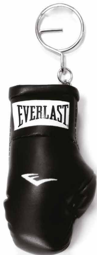
SKU:700000 -BK COLOR: Black