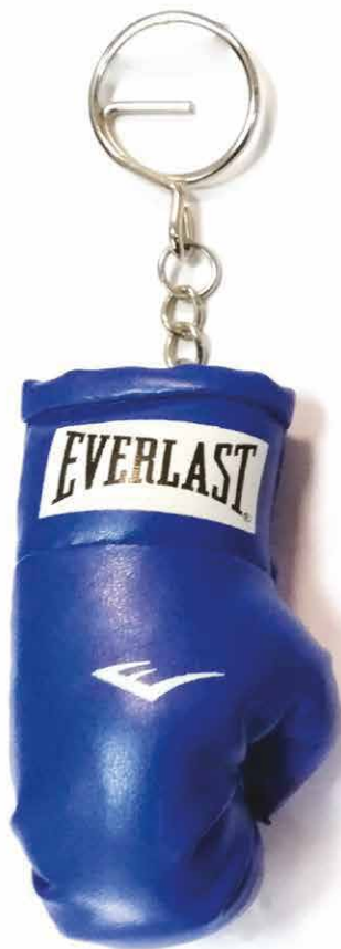
SKU:700000 -BL COLOR: Blue