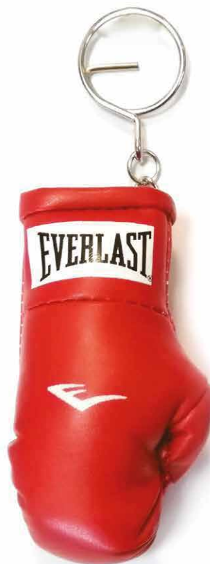
SKU:700000 -RD COLOR: Red