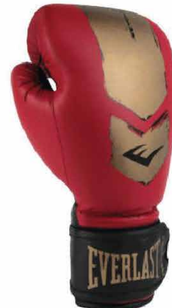
RED / GOLD