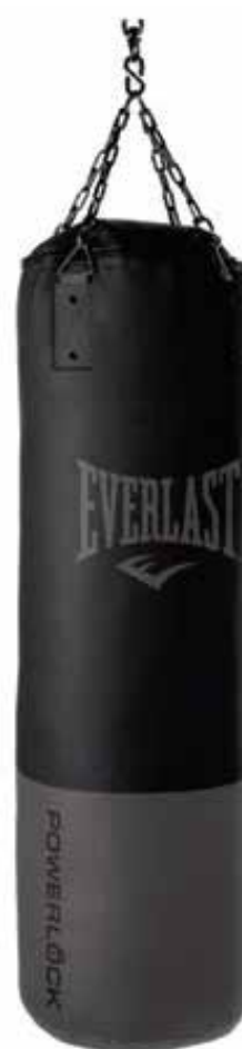
SKU: P00003056 Color: Black