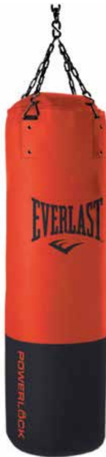
SKU: P00003060 Color: Red