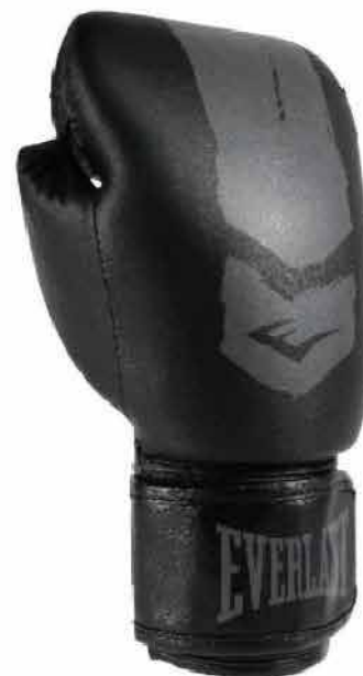
BLACK / GREY