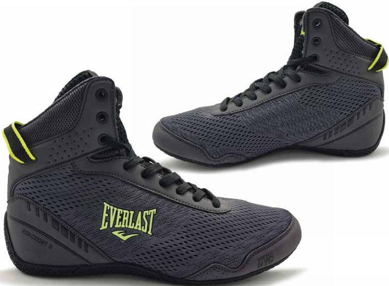
SKU: ELMA39C CHARCOAL / LIME