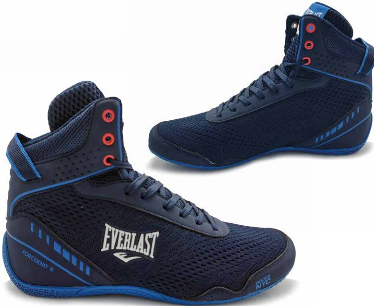
SKU: ELMA39E INDIGO / SKYDIVER