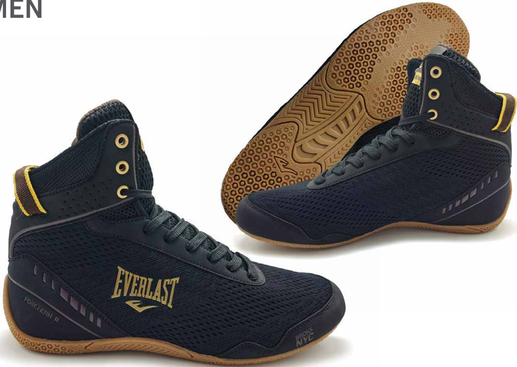
SKU: ELMA39A BLACK / GOLD