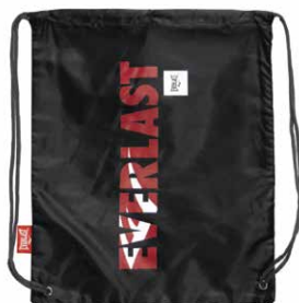
REF: EV2SKB11 COLOR:Negro