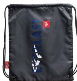
REF: EV2SKB12 COLOR:Gris