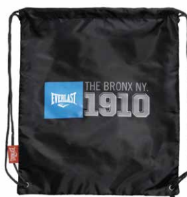
REF: EV2SKB31 COLOR:Negro