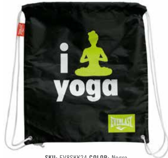
SKU: EV8SKK24 COLOR: Negro