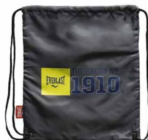
REF: EV2SKB32 COLOR:Gris