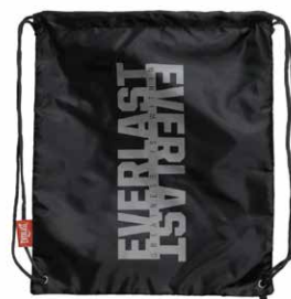
REF: EV2SKB21 COLOR:Negro