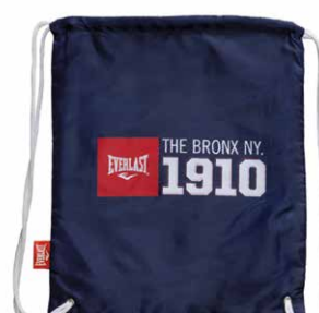
REF: EV2SKB33 COLOR:Navy