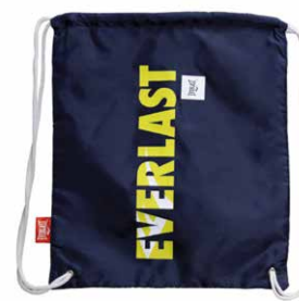
REF: EV2SKB13 COLOR:Navy