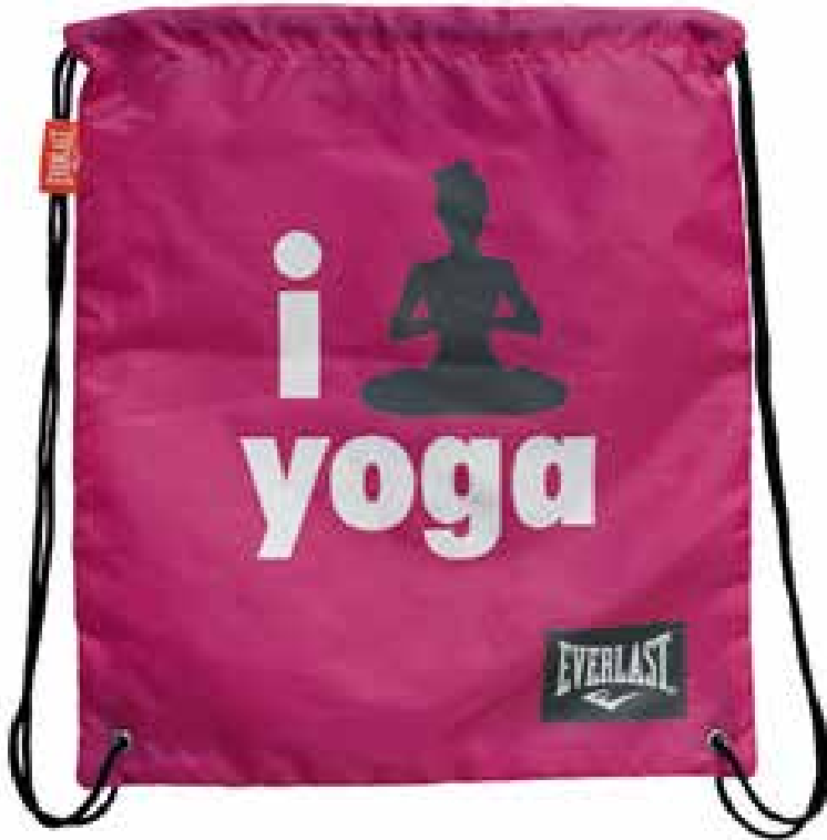
SKU: EV8SKK23 COLOR: Fucsia