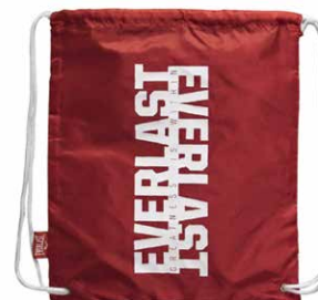
REF: EV2SKB27 COLOR:Rojo