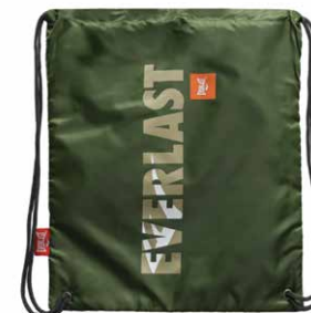
REF: EV2SKB16 COLOR:Oliva