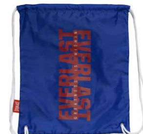
REF: EV2SKB23 COLOR:Azul