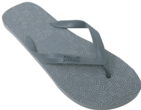
EVS4TM102 COLOR: CHARCOAL