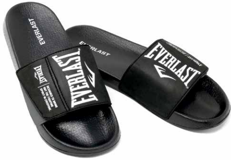
OVER SLIDES SKU: EVSD20881 COLOR: Black / White