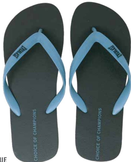
EVS4TM201 COLOR: BLACK / BLUE