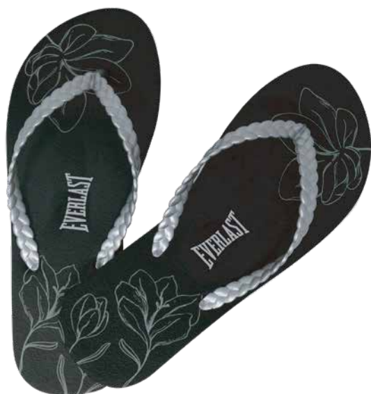
EVS4TL301 COLOR: BLACK