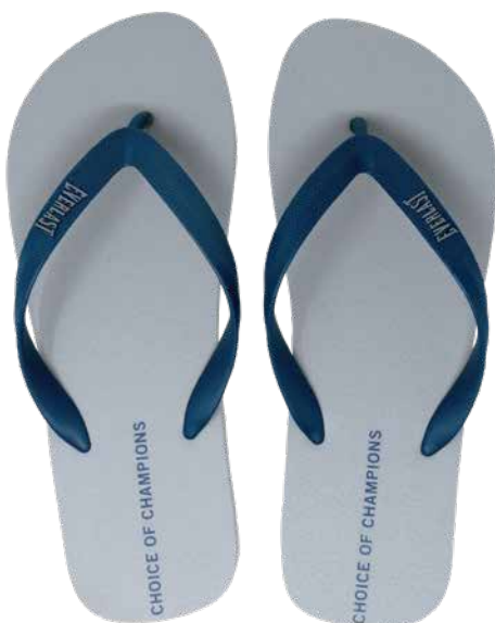
EVS4TM205 COLOR: GRAY