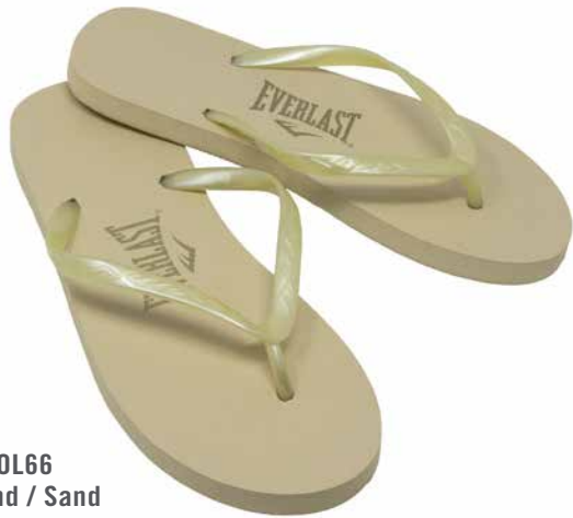
SKU: EVS2BOL66 COLOR: Sand / Sand