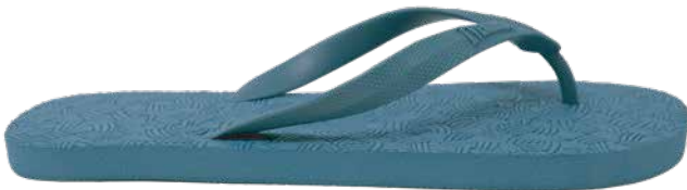
EVS4TM106 COLOR: GREEN