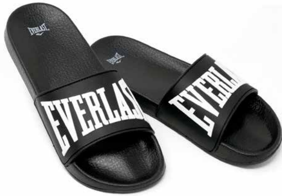
OVER SLIDES SKU: EVSD20311 COLOR: Black / White