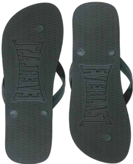
EVS4TM101 COLOR: BLACK