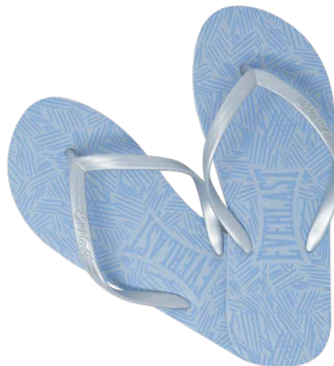
EVS4TL704 COLOR: BLUE

Useful and comfortable to wear, these flip flops will show off your sense of style at every step, from the pool to the beach or gym. made of a material that is gentle to the skin.