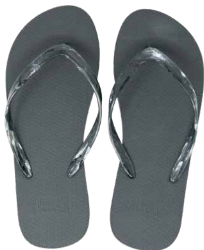
EVS4TL101 COLOR: BLACK