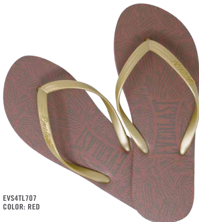
EVS4TL707 COLOR: RED

Useful and comfortable to wear, these flip flops will show off your sense of style at every step, from the pool to the beach or gym. made of a material that is gentle to the skin.