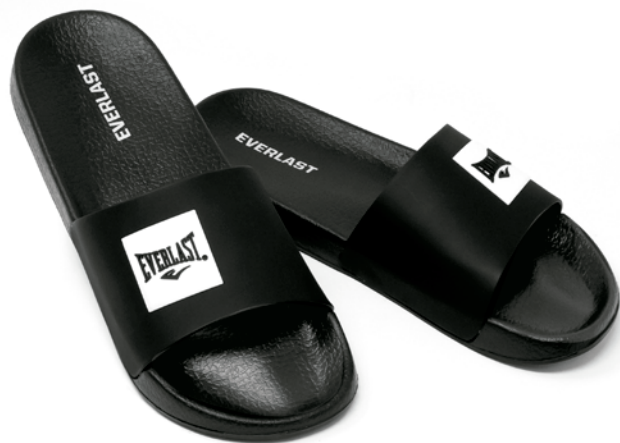
SEAL SLIDES SKU: EVSD20112 COLOR: Black