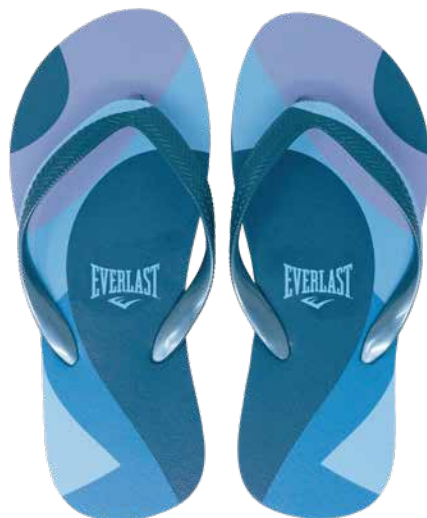
EVS4TL903 COLOR: BLUE