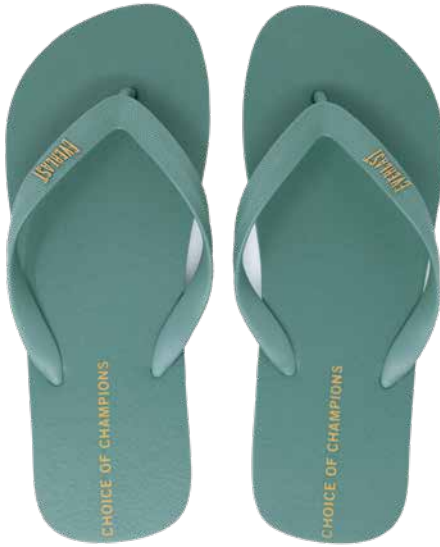
EVS4TM206 COLOR: GREEN