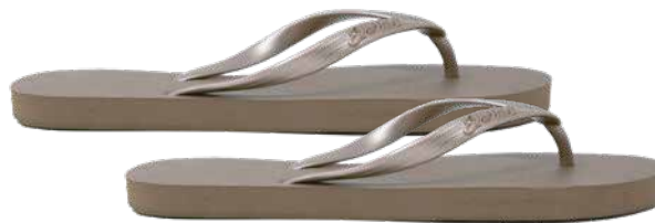
EVS4TL205 COLOR: BROWN