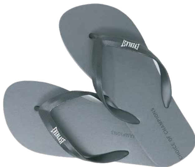
EVS4TM202 COLOR: CHARCOAL