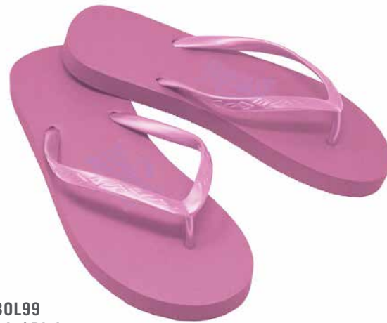
SKU: EVS2BOL99 COLOR: Pink / Pink