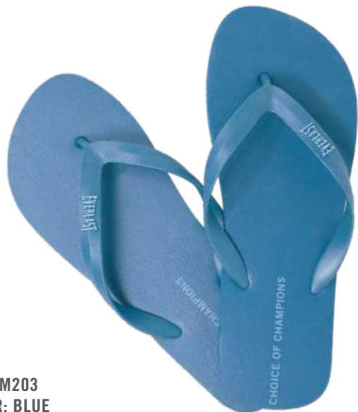
EVS4TM203 COLOR: BLUE