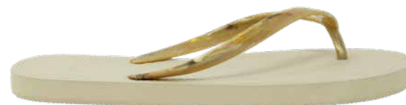
EVS4TL108 COLOR: WHITE