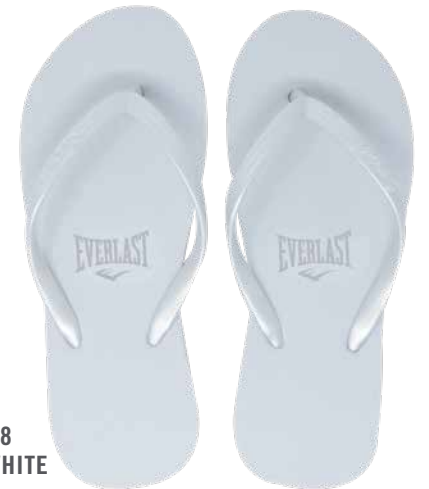
EVS4TL208 COLOR: WHITE