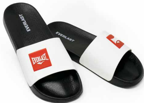
SEAL SLIDES SKU: EVSD20118 COLOR: White / Red

MEN SIZE 7 / 12 7/1 - 8/2 - 9/3 - 10/3 - 11/2 - 12/1 12 PAIR