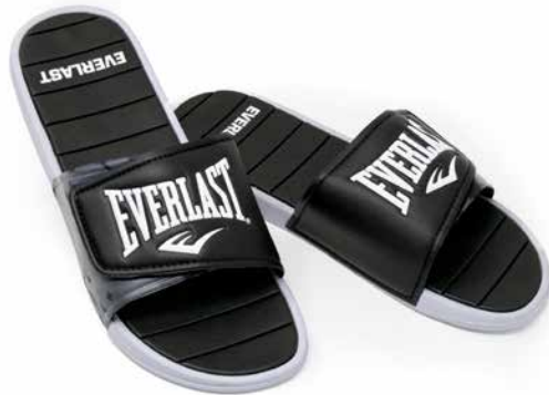
ADJ CAMO SLIDES SKU: EVSD20892 COLOR: Black / Camo / White

MEN SIZE 7 / 12 7/1 - 8/2 - 9/3 - 10/3 - 11/2 - 12/1 12 PAIR