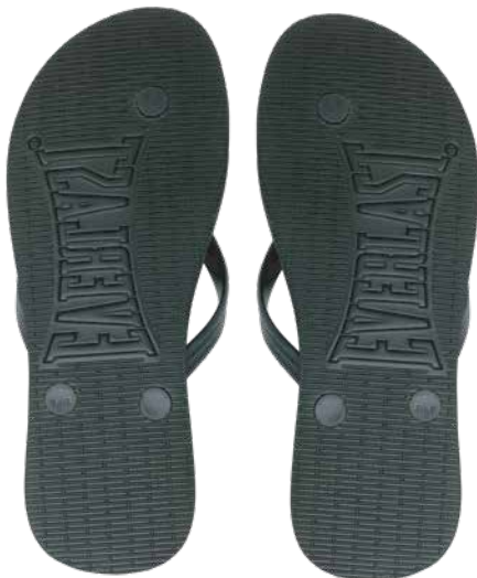
EVS4TL201 COLOR: BLACK