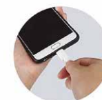
Connect Your Phone