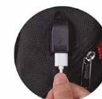
Connect with Your Own USB Cable