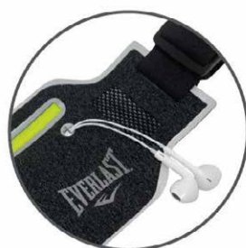
CONECTOR PARA AURICULARES