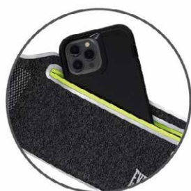
BOLSILLO ELÁSTICO CON CREMALLERA