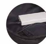
Connect Your Own Power Bank Inside